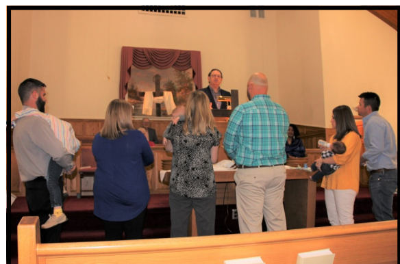
Baby Dedication Ceremony